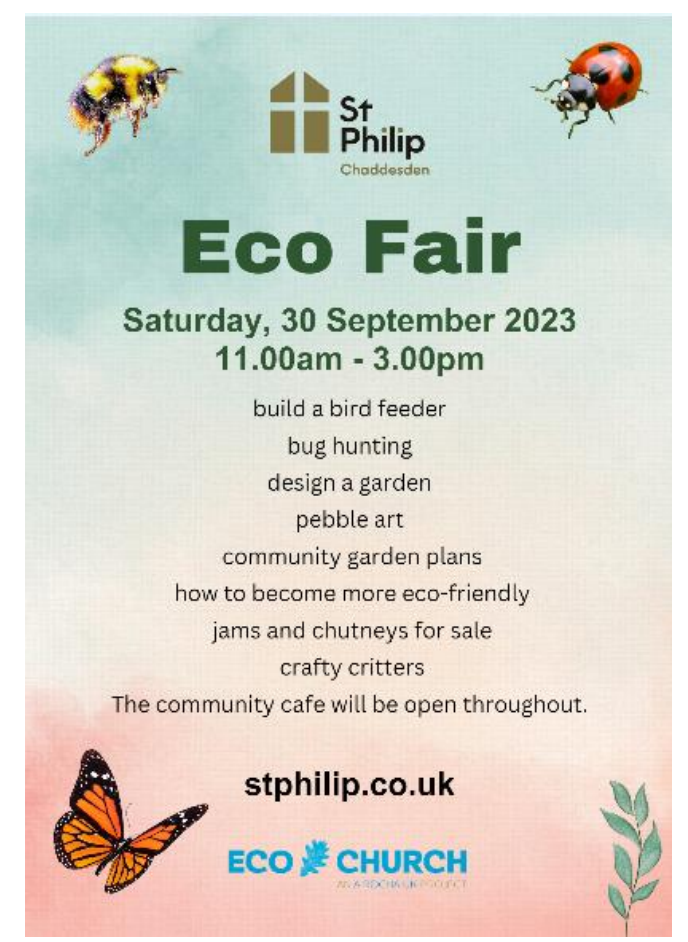
Figure 2 https://stphilip.co.uk/eco-church Advert used for the event.