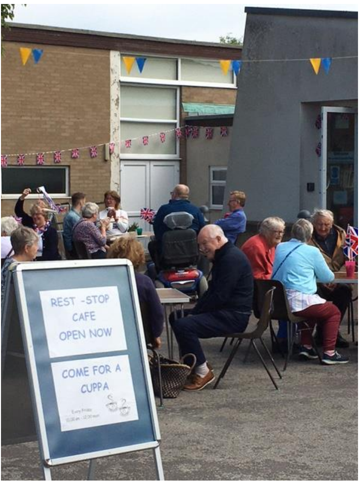
St John's Cafe celebrating the Platinum Jubilee

All Saints Cafe operates on Wednesdays 10am-12 and started from a gazebo on a small grassy patch at the bottom of the car park next to the church. Passers-by as well as church members popped in for a drink and a chat and many said it was just good to be speaking to people again.