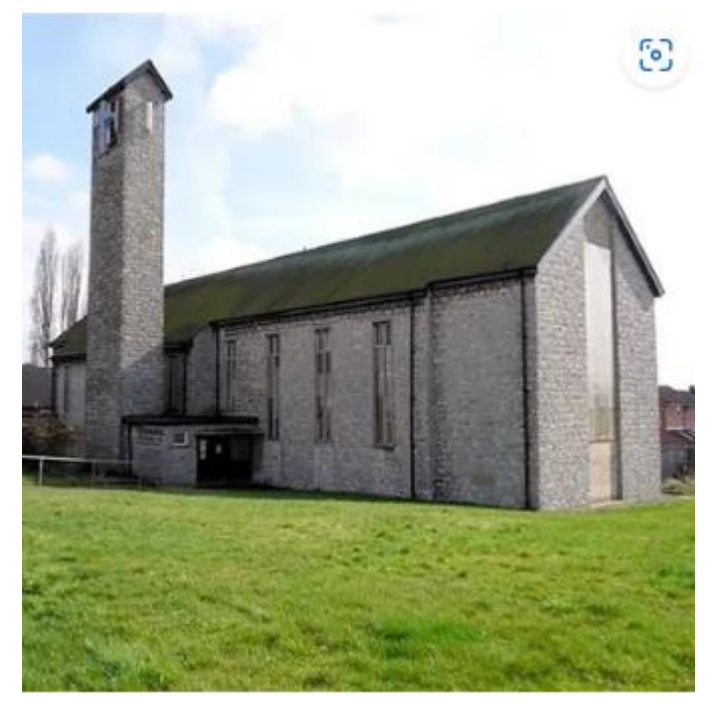
Figure 1 https://stphilip.co.uk/about-us

Heatwaves, storms, floods, wildfires, and earthquakes – what more evidence could we need to see that Planet Earth is in trouble – threatened by the very beings tasked to be its guardian? Too late we have realised that we cannot sit and wait for someone else to find a solution, we need to take action ourselves.