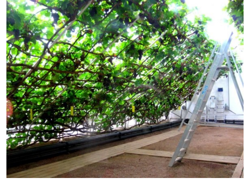
Hampton Court vine

Lord God, whose Son is the true vine and the source of life, ever giving himself that the world may live: may we so receive within ourselves the power of his death and passion that, in his saving cup, we may share his glory and be made perfect in his love; for he is alive and reigns, now and for ever. Amen.